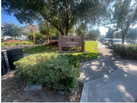
Needs sign somewhere on Adrian St.: