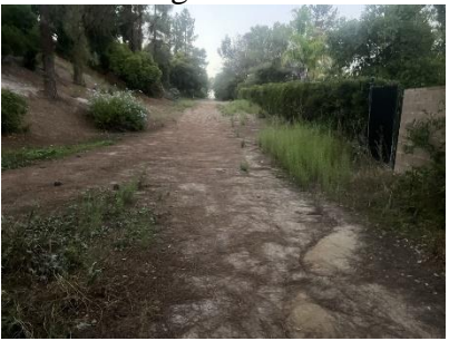
23. Twin Peaks Trail: Need sign at intersection of Avocado Trail and Twin Peaks Trail here: