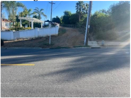
This area needs sign and arrow where trails goes adjacent to neighborhood.