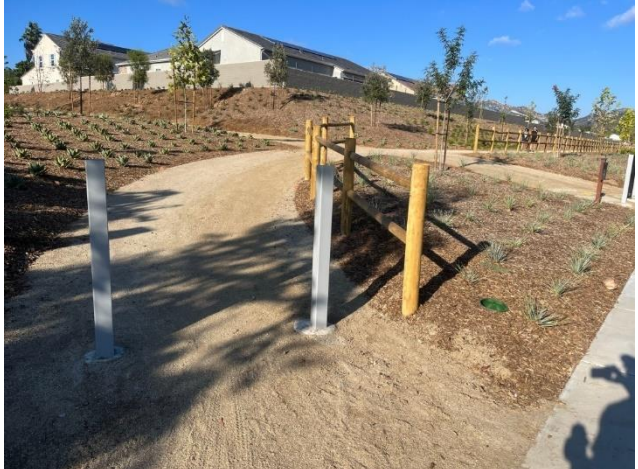
Signs on both sides of street at entrance to The Farm are needed.