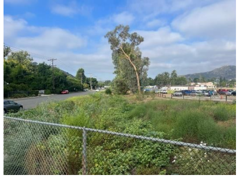
Need sign here at Tierra Bonita Rd

Need sign here at intersection to unnamed trail on Espola. 24. Kent Trail: this trail is not labeled at east end beginning of trail – needs sign here: