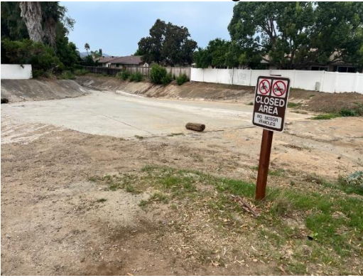
This intersection also needs sign and arrow.