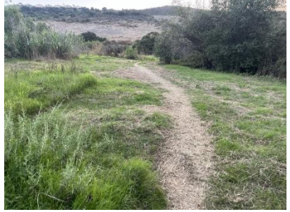
Need sign here: