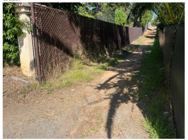
Need sign here stating "Lomas Verdes Trail"

This trail is very easy to get lost – multiple intersections. All intersections need to have "Lomas Verdes Trail" sign with arrow pointing the correct direction. This is one location that needs sign and arrow about ½ mile up trail.