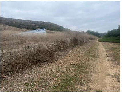
Need sign here: