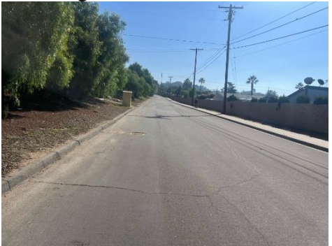
Needs sign up Adrian St.: