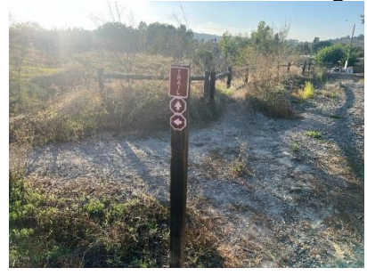
Need sign at start of trail behind Stater Bros off of Midland Rd