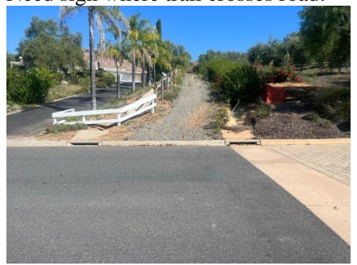
Need sign here: