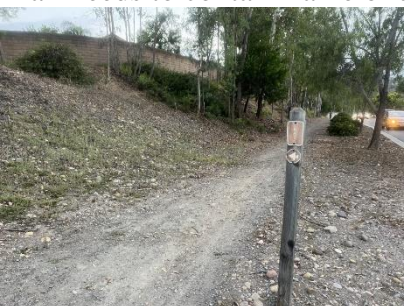
Need sign here: