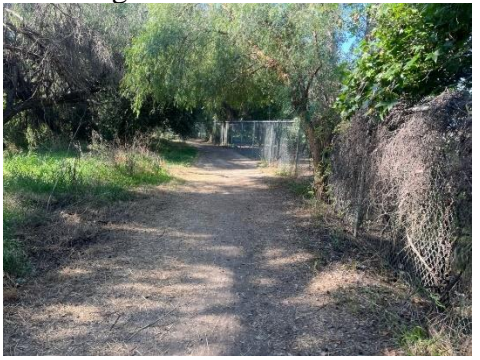
25. <u>Dearborn Trail:</u> needs sign at beginning of trail: