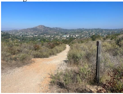
Need sign where trail crosses road: