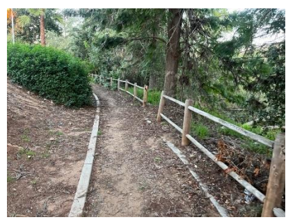
Need name of trail on this sign instead of "trail"