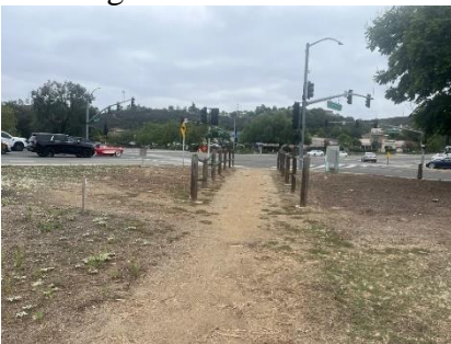
Need sign at start of trail past Scripps Poway Parkway: