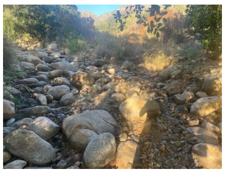
27. Poway Creek Trail: this trail is not well marked – need sign where trail starts: