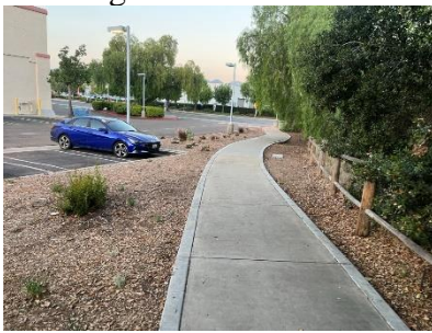
Need sign and arrow labeling where trail goes south then east of Stater Bros: