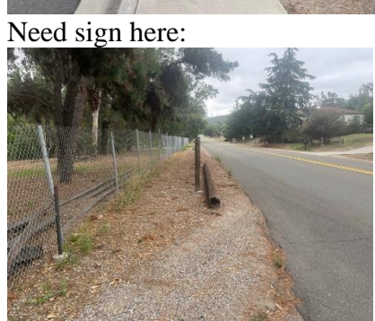
End of trail needs to be labeled with sign: