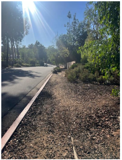
Needs sign where trails crosses Lake Poway Rd

14. <u>Avocado Trail Link:</u> this trail goes up right side of Lake Poway Rd – needs sign and arrows where trail crosses streets