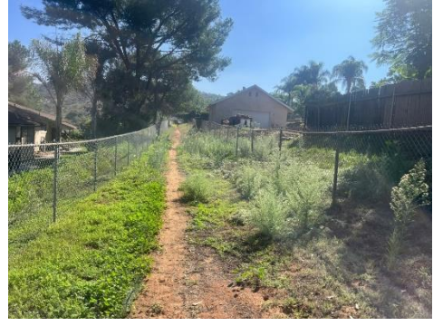
This sign needs name of trail: