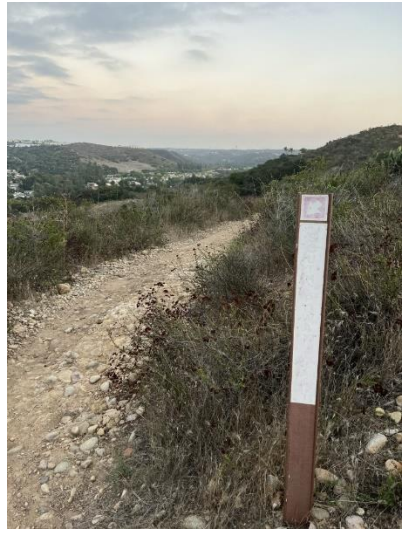
Need sign with trail name here: