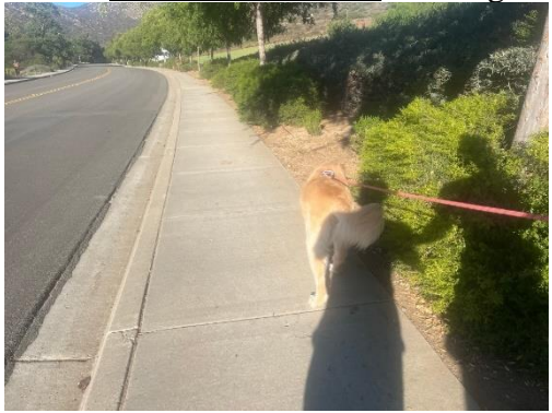
Need sign here: