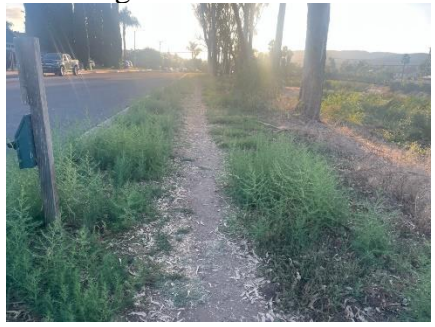
Need sign here where trail goes behind cul de sac near Boys & Girls Club: