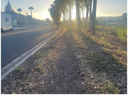
Needs sign here where trail enters Community Park from street: