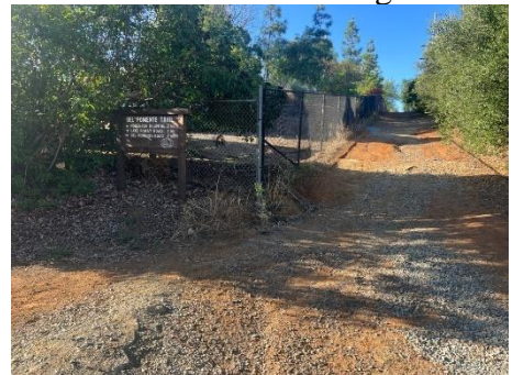
Needs sign and arrow where it crosses road.