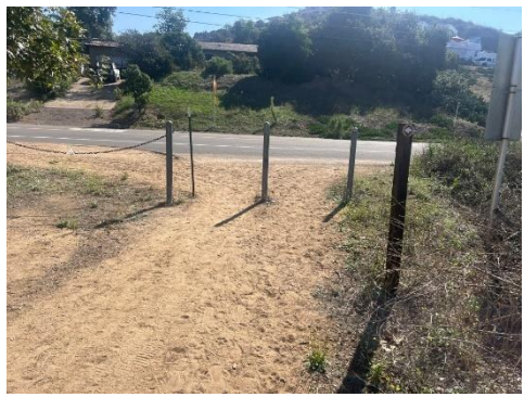
Need sign here where trail goes east off of Tierra Bonita Rd: