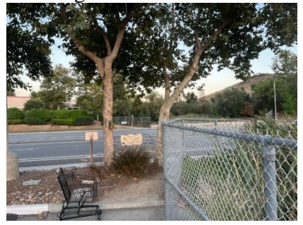
Needs sign where trail goes behind Poway movie theater: