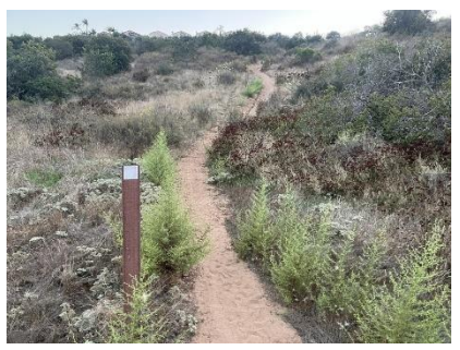
Need sign here: