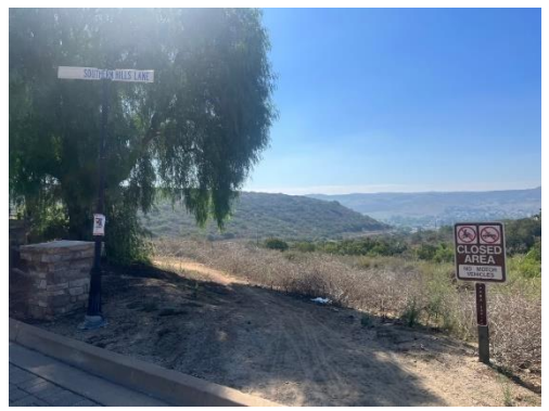
Need sign at end of trail where it intersects Espola near Poway grade: