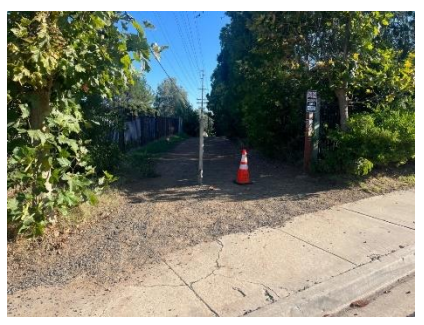
Needs "Avocado Trail" sign and arrow here