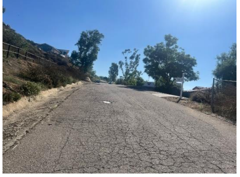
Needs sign and arrow where Adrian St. intersects Tierra Bonita Rd: