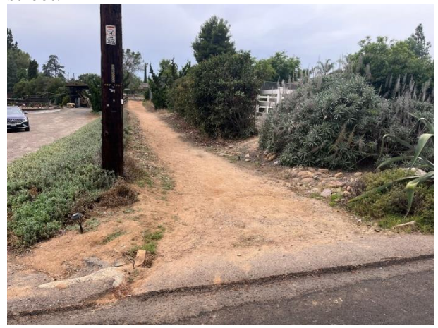
This intersection needs sign and arrow.