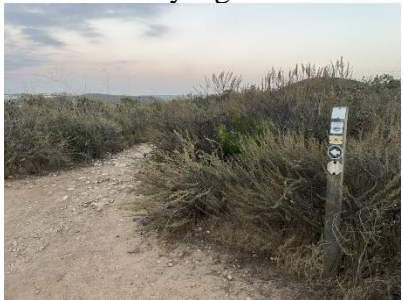
This trail needs new stickers – faded: