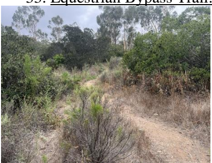
Needs sign here:

33. Equestrian Bypass Trail: this trail needs signs at intersection of trail: