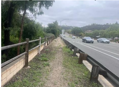
Need sign here: