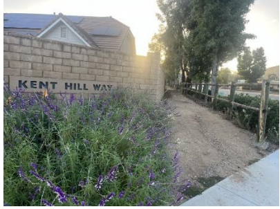
Trail needs to contain name of trail and not just "trail"