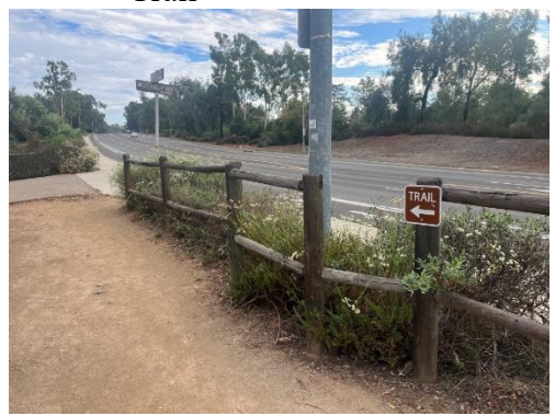
Should have "Blue Sky Trail" sign here also pointing to right

7. <u>Blue Sky Trail</u>: fairly short well marked trail – all signs should be labeled "Blue Sky Trail" instead of "Trail"