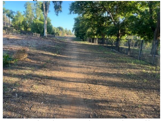
Intersection here needs "Espola Trail" sign instead of "Trail"

Need sign and arrow where short trail on Lake Poway Rd veers right down Espola Trail behind houses.