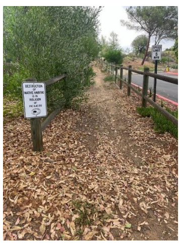
It's always useful having sign at road intersections: