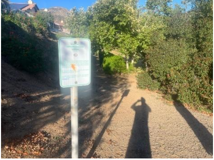
Need sign labeling where trail ends: