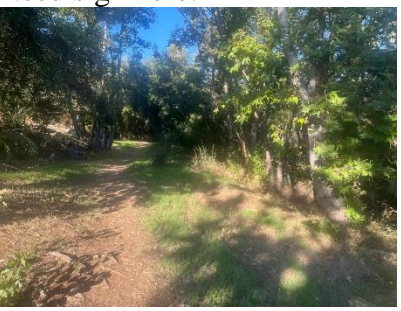
Needs sign here: