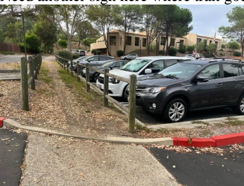
Need sign here:

Need another sign here where trail goes past parking lot of Episcopal Church.