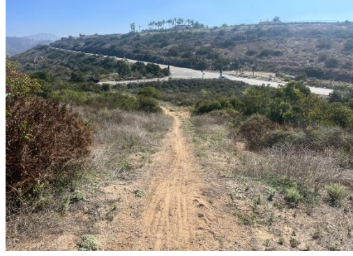
26. Garden Road Trail: need sign where trail goes down sidewalk: