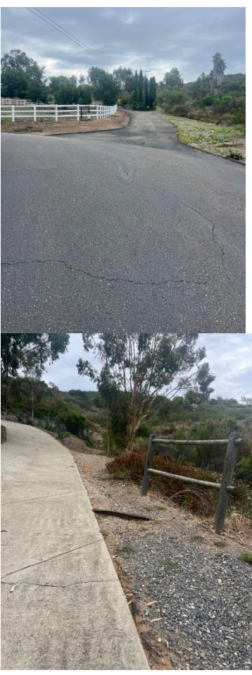
And needs sign here where trail crosses long driveway: