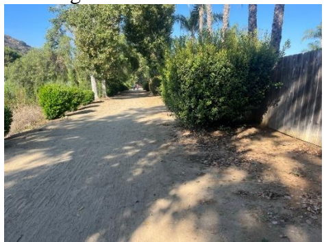
Need sign here where trail crosses street: