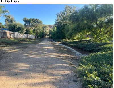
Need sign where trail goes behind houses: