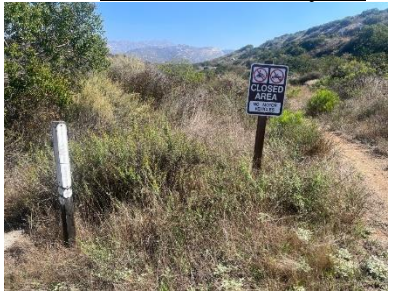
Super easy to get lost on this short trail – needs 2-3 more signs:

21. Rattlesnake Canyon: needs new sign at start of trail – can barely read it: