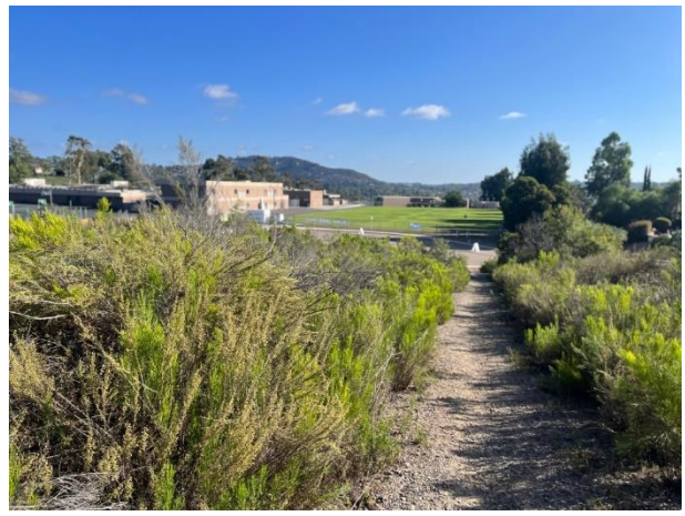
Needs sign with arrow where West Ridge Trail intersects Espola Rd (Espola Road Trail) just west of Valle Verde Park.

Trails gets confusing as it intersects / hits Chaparral Elementary School – this area needs at least 3 signs with arrows. "Trail" is sidewalk in front of school for short distance – needs sign.