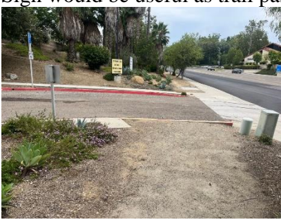
Sign somewhere as trail goes up behind buildings would be helpful: (sign on both sides of this):