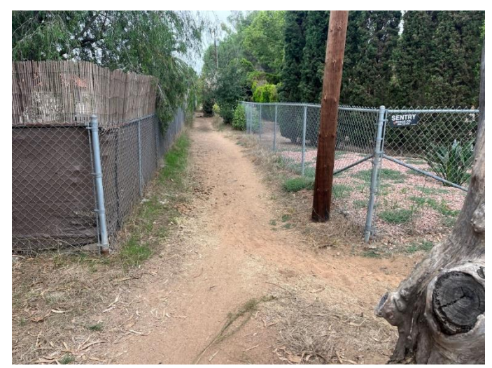
Green Valley Trail intersections several streets in neighborhood – needs sign with arrows on both sides of street.