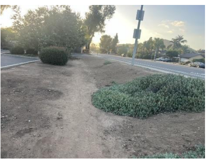
Need sign here: