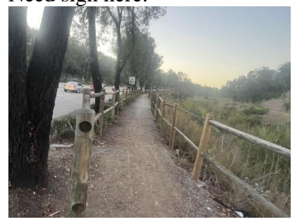
And need sign here at intersection with unnamed trail: