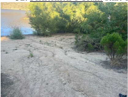
End of trail needs to be labeled: