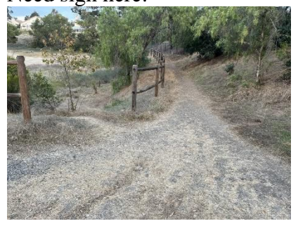
Need name of trail on this sign: