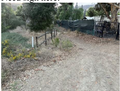
Need sign here: