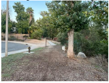
Need sign where trail intersects Community Rd.