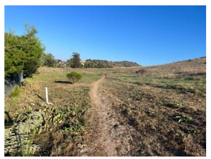
28. <u>South Poway (Trans-County) Trail:</u> this trail is longest Poway trail and needs lots of signs, especially at all the intersections with unnamed trails – needs trail here: